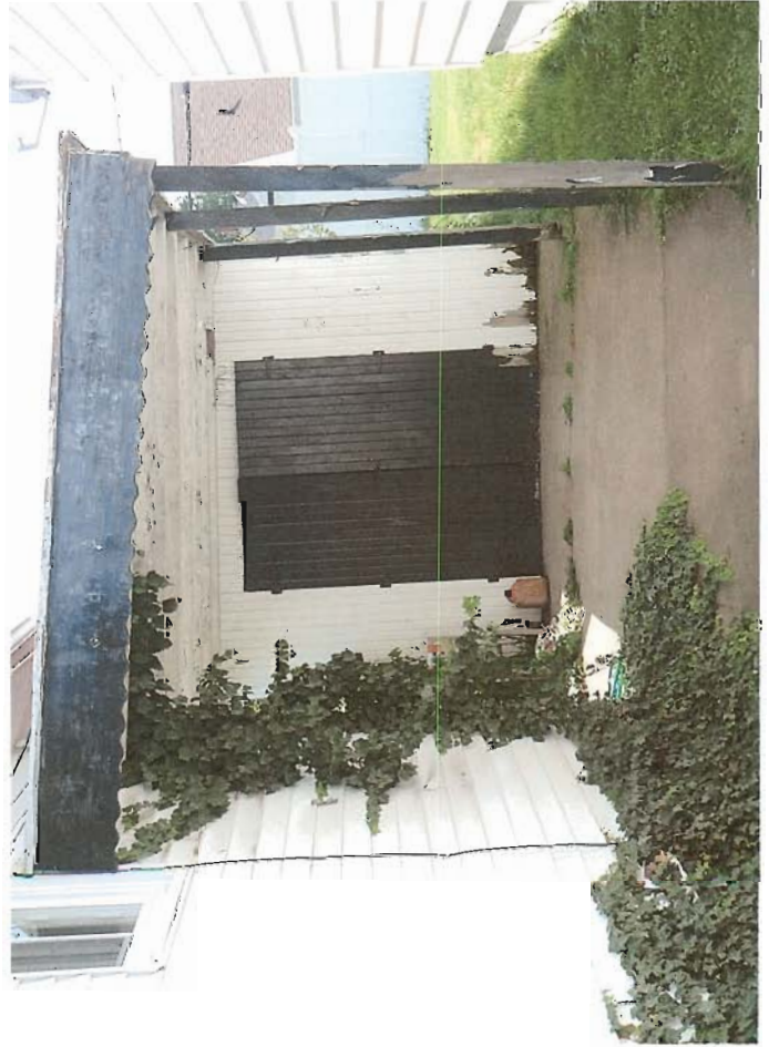
2827 SHERMAN ROAD 8/6/09