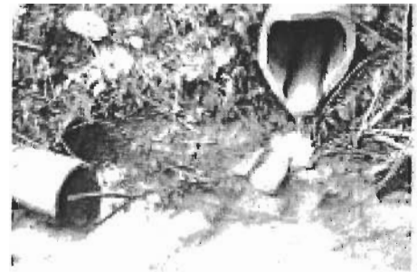
Don't discharge your power washing wastewater directly into a creek, river or other water body of the state unless you have a permit for the discharge.

In addition, wastewater treatment activities such as removing metals, detergents, oils or other chemicals would likely be required prior to any discharge. Units such as oil/water separators or holding tanks used for wastewater treatment or storage require a permit-to-install (also called a PTI) from Ohio EPA's Division of Surface Water.