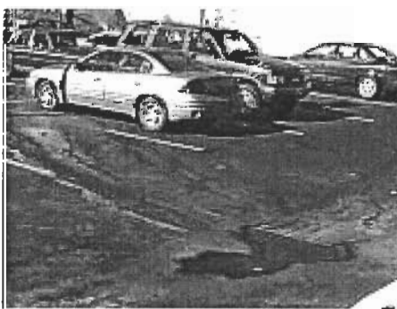
Drains in parking lots usually lead to storm sewers. You CANNOT discharge your power washing wastewater into a storm sewer.

You need to contact the POTW ahead of time to find out where wastewater should be taken and about other requirements you may need to follow. The