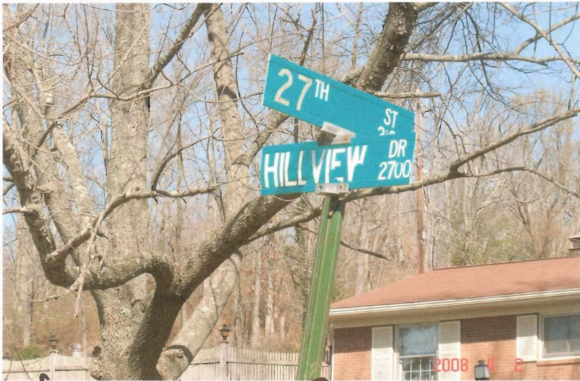
NORTH END OF 27TH STREET