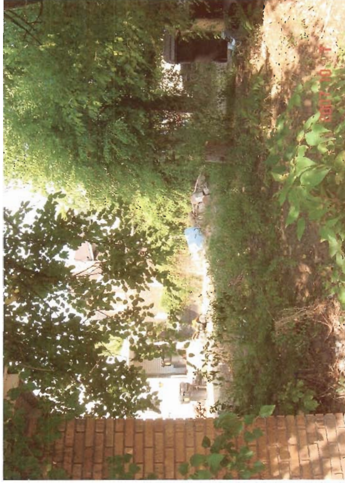
1232 17th STREET