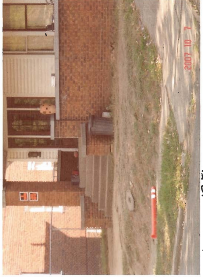
1232 17th STREET