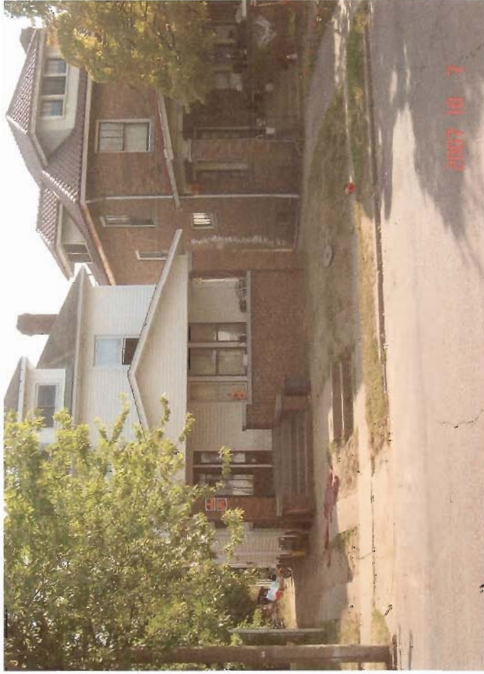
1232 17th STREET