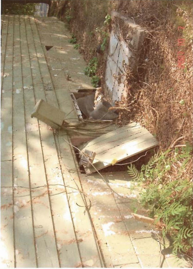
1225 ALBERT STREET