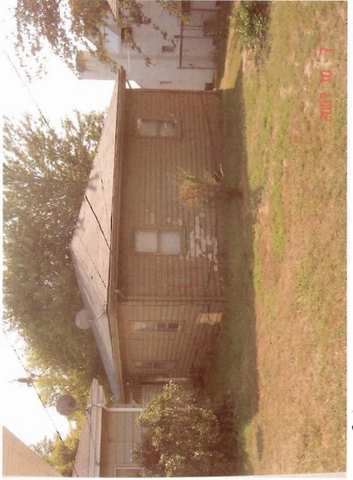
1225 ALBERT STREET