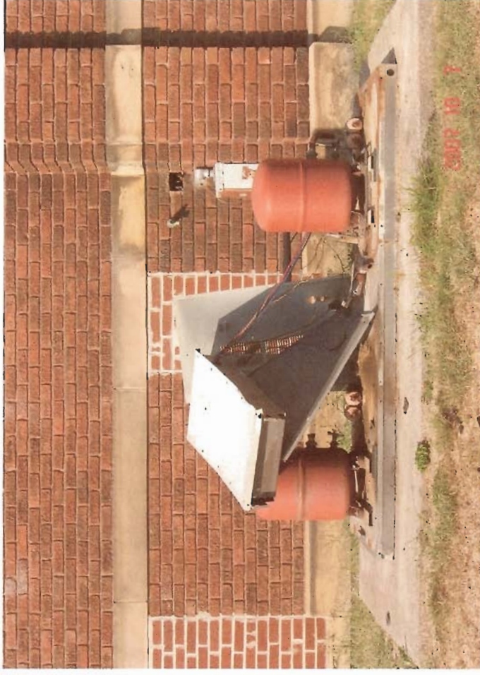
AULEN CHAPEL CHURCH