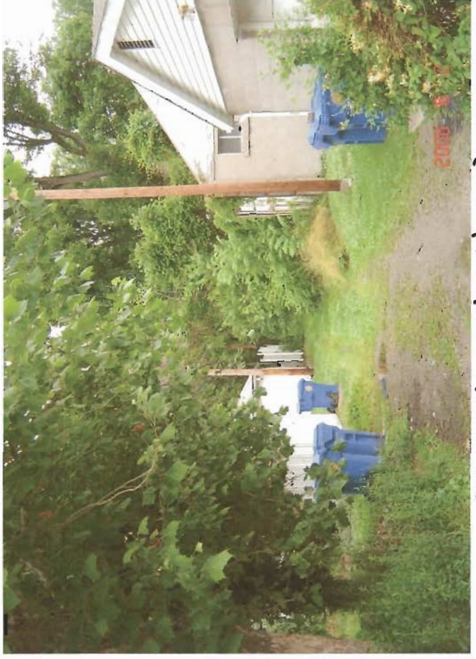
ALLEY (LOOKING NORTH)