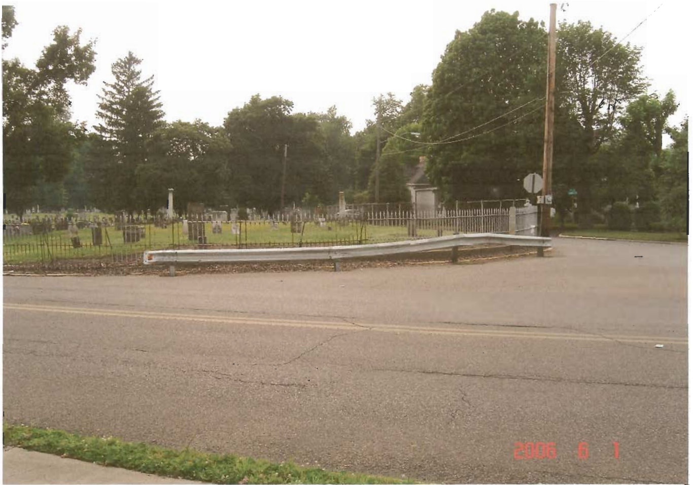
17 TH STREET @ GARFIELD ST (DAMAGED GUARDRAIL)