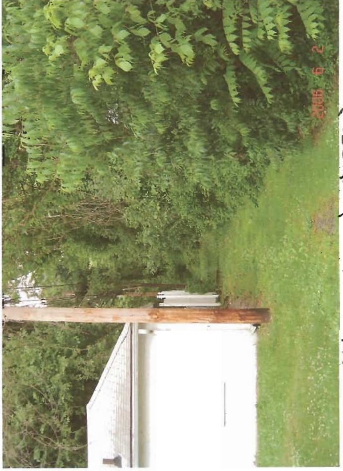
ALLEY (LOOKING NORTH)