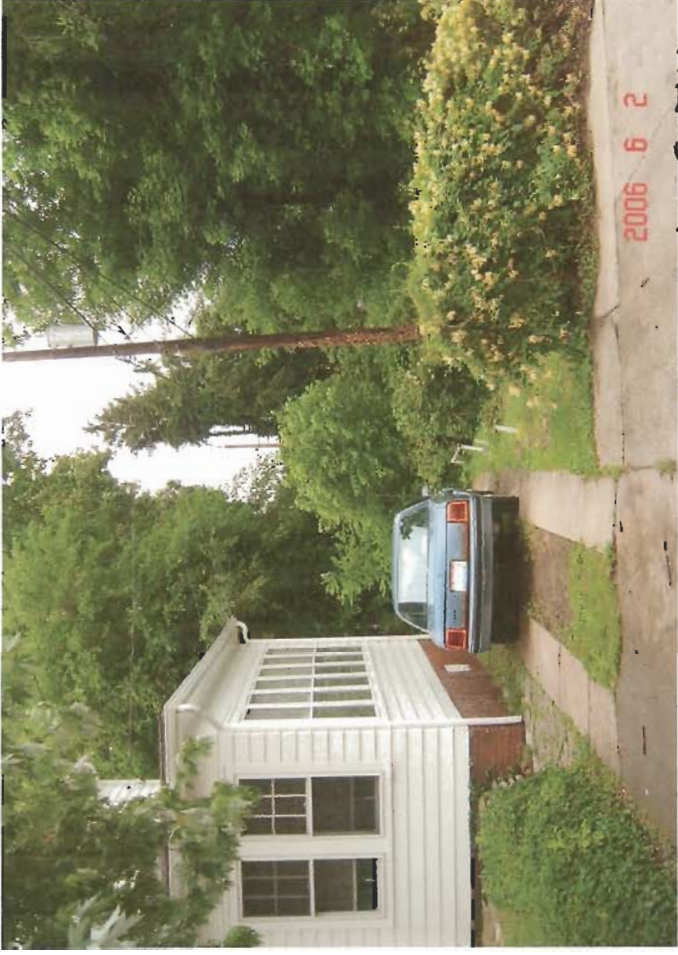
ALLEY (© OAKLAND LOOKING SOUTH)